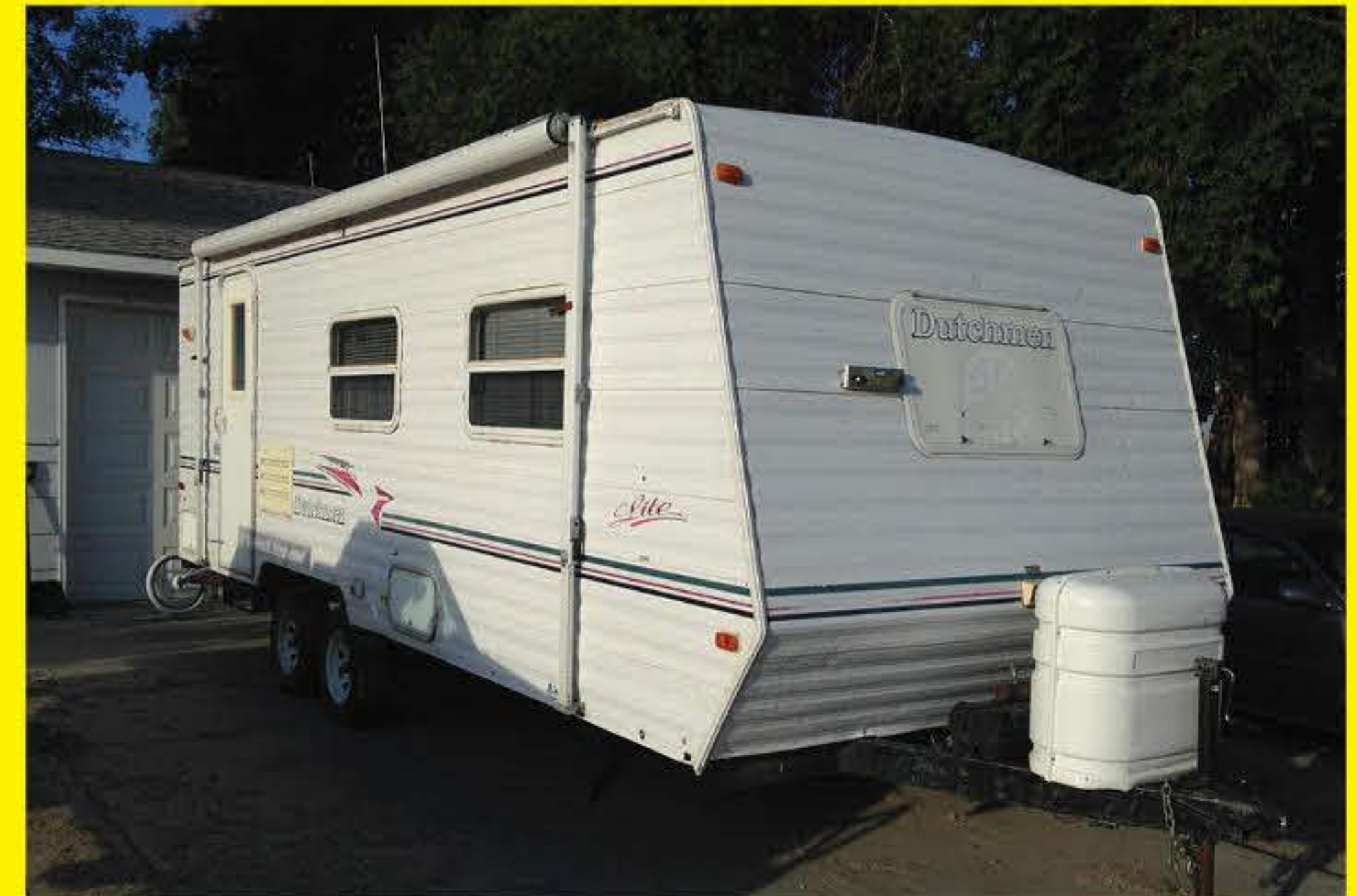
24', Full size bed, AC, refrigerator, freezer, microwave, stove, bathroom with shower

Jim Moss Arena RV and Camping Rates and Info